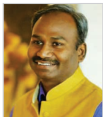
Sh. M Nagarajan, IAS Deputy Municipal- Commissioner, Surat