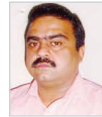
Sh. Hemant Gera, IAS Municipal Commissioner Jaipur