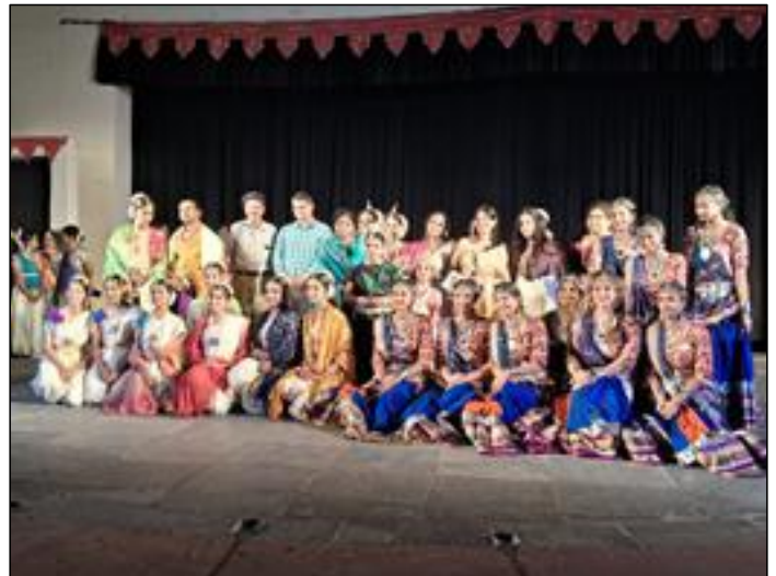
First year students performed Dance in Lok Kala Mandal on "International Dance Day" on 24 th May, 2023.