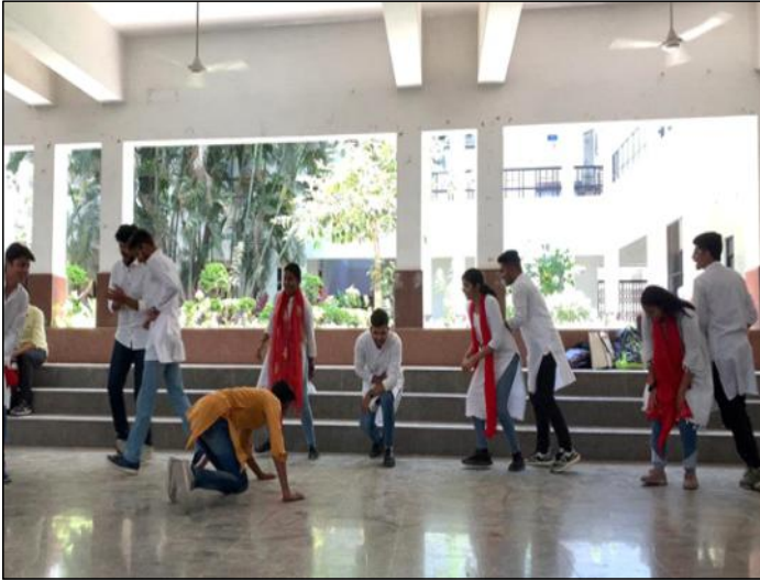
The Department of Humanities and Science organized Nukkad Natak on "Animal Awareness" on 15 th May, 2023.