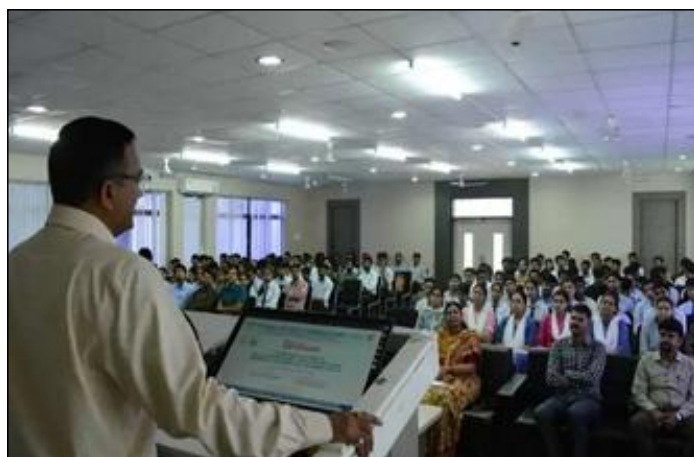
Department of CSE organised 2nd International Conference on “Multi-Disciplinary Applications and Research Technology (ICMART-2023)” during 19 th & 20 th May, 2023.