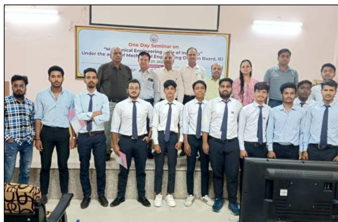
Mechanical Engineering Department students participated in seminar on “ Mechanical Engineering - Life of Industry ” held at Institute of Engineers on 27 th May, 2023.