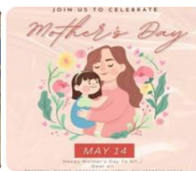
The Department of Humanities and Science organised “ Mother's Day Celebration ” online an event on 14 th May, 2023.