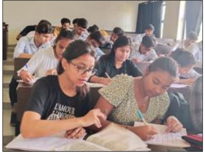
Dept of Humanities & Sciences organised "Examine Yourself" activity on 17 th May, 2023 to prepare students for the upcoming examinations.