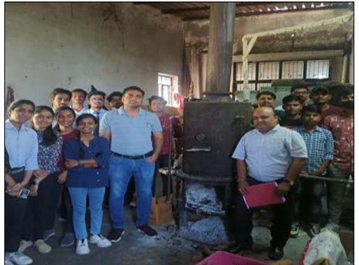
Department of Mechanical Engineering organised Training on “Steam Cooking System” for first year student and also visited the hostel's steam cooking system on 12 th May, 2023.