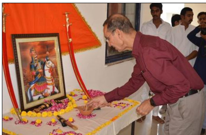
Department of Civil Engineering celebrated the Birth Anniversary of Mewad Hriday Samrat Maharana Pratap on 22 nd May, 2023.