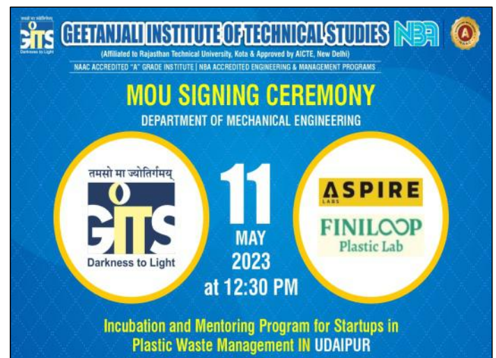
Mechanical Engineering Department organised a MOU signing ceremony between GITS and Aspire Finiloop Plastic Lab on 11 th May, 2023. MOU will provide incubation and mentoring to our students for startup in the field of plastic waste management in Udaipur city.