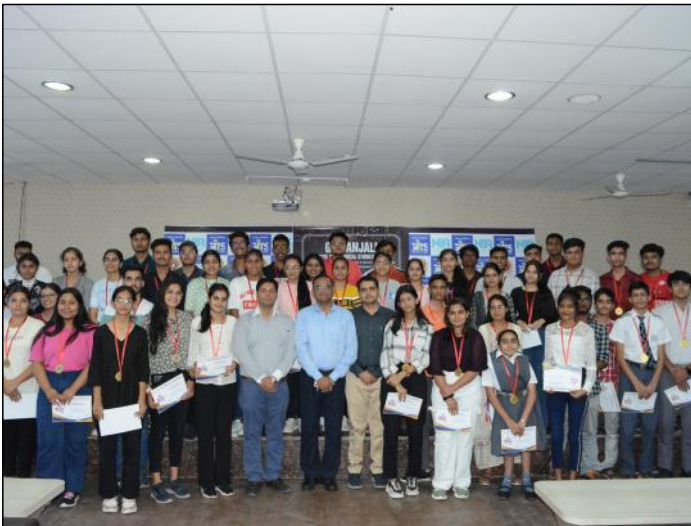
GITS and 94.3 My FM organised the first "My City Topper" Event on 27 th May, 2023.