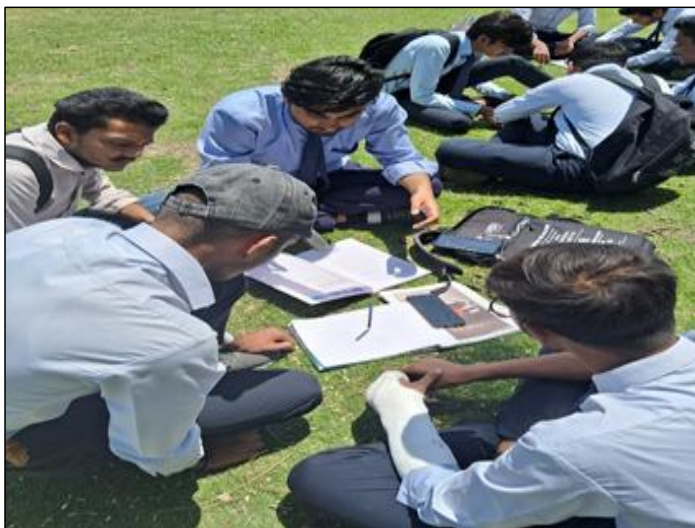
Department of H&S in association with Jawaharlal Nehru Planetarium, Bangalore, organized Fun with Physics activity at the occasion of Zero Shadow Day on 25/04/2023.