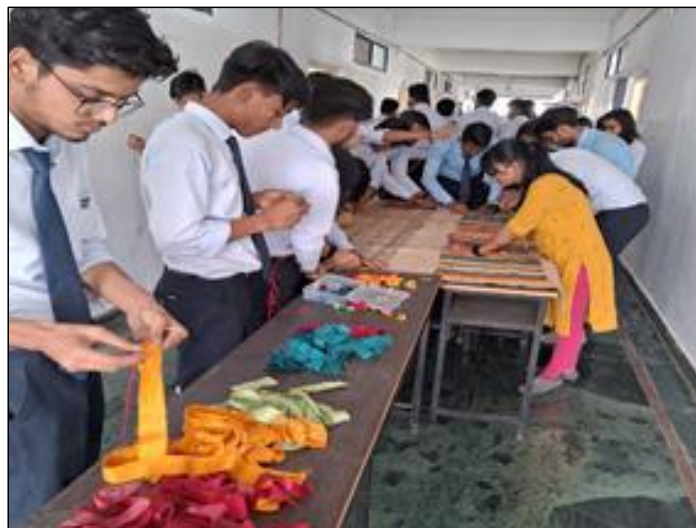
Department of H&S Secure Meter Dharohar unit, udaipur, organized Fun with Physics activities included doodle-making, creating various designs, and other engaging tasks on 27/04/2023.