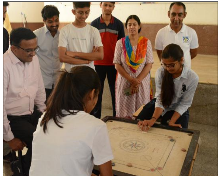
A sport and Games meet was organised from 28/4/2023 to 30/4/2023