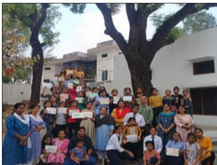
Department of Management Studies under the banner of NSS took initiative to reach out to the community by visiting the "Divyaang Student Hostel" on 27/04/2023