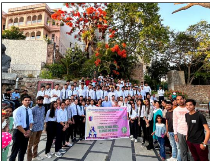
Geetanjali Institute of Technical Studies joined paws with Udaipur Animal Feed to organized a rally at Fateh Sagar in honour of Earth Day, to protect our beloved Mother Earth on 23-04-2023.