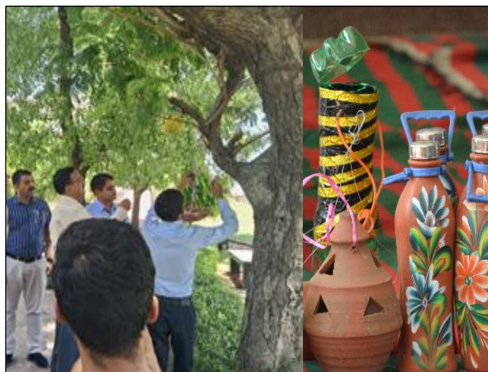
Geetanjali Institute of Technical Studies joined paws with Udaipur Animal Feed to celebrated Earth Day in GITS campus on 21/04/2023.