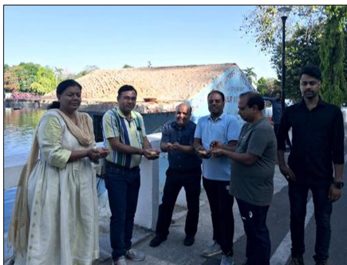
GITS Students and faculty members and Animal Feed came together to feed animals and birds to educate role in saving birds and preserving our planet on 23/04/2023.