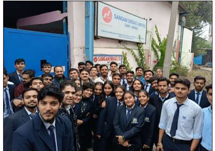
Department of Electrical Engineering organised an industrial visit at Sangam India Ltd., Bhilwara , on 16 th December, 2023.