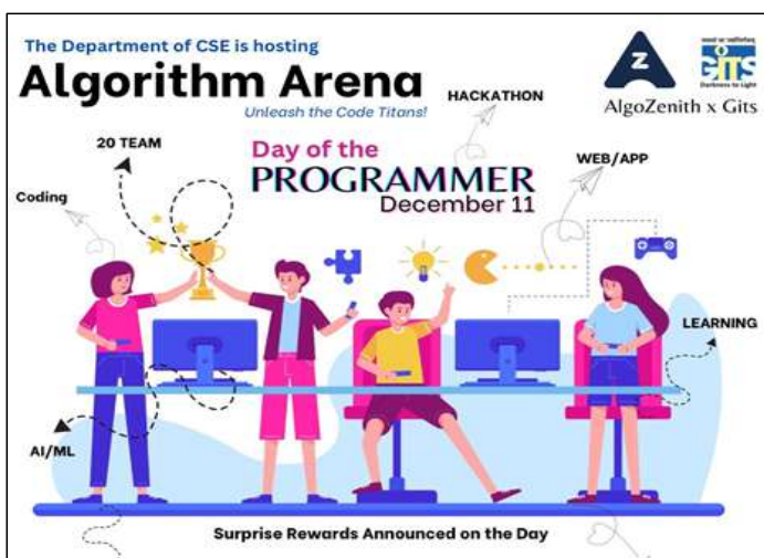
Department of CSE organised a Coding Event “ Algorithm Arena ” on 11th December, 2023.