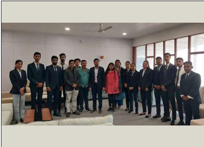
Marketing and Operations specialisation students of Department of Management Studies went for Live Research Project at Shree Ganesh Plywood Industries on 23 rd December, 2023.