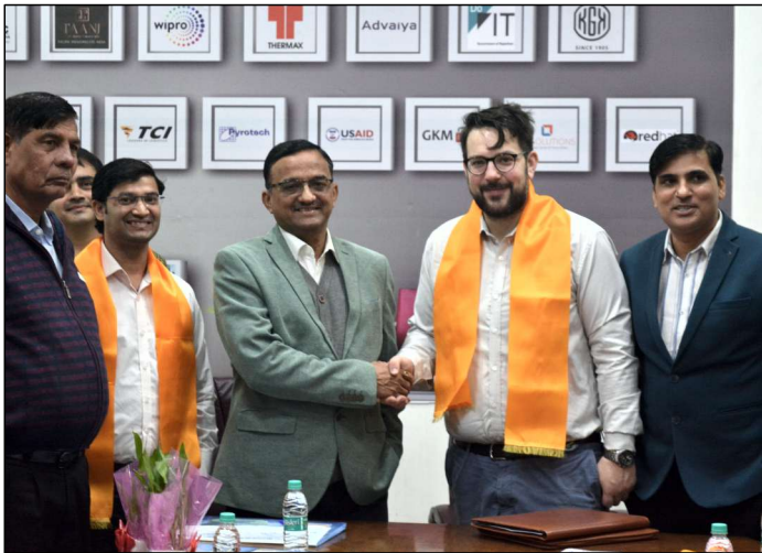
GITS signed a MoU with GHH India Mining & Tunnelling Equipment Pvt. Ltd. a German Subsidiary on 6 th December 2023 to conduct Core Engineering Hands-on Training for proper maintenance and failure analysis on mobile hydraulic machinery etc. to students and staff.