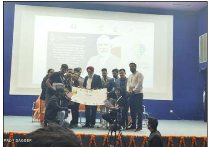
GITS Team Bright Sparks secured first position and Won of Rs. 100000 in "SIH 2023" Hardware edition at Nodal centre Manav Rachna University, Faridabad, Haryana.