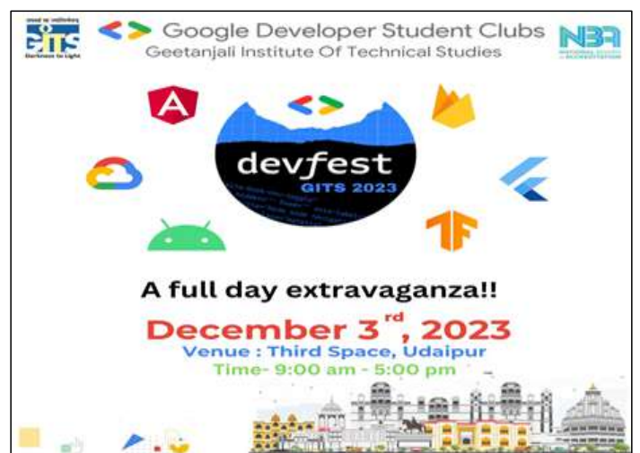
Department of CSE and GITS Google Developer Student Club organised Devfest at Third Space , Udaipur, on 3 rd December, 2023.