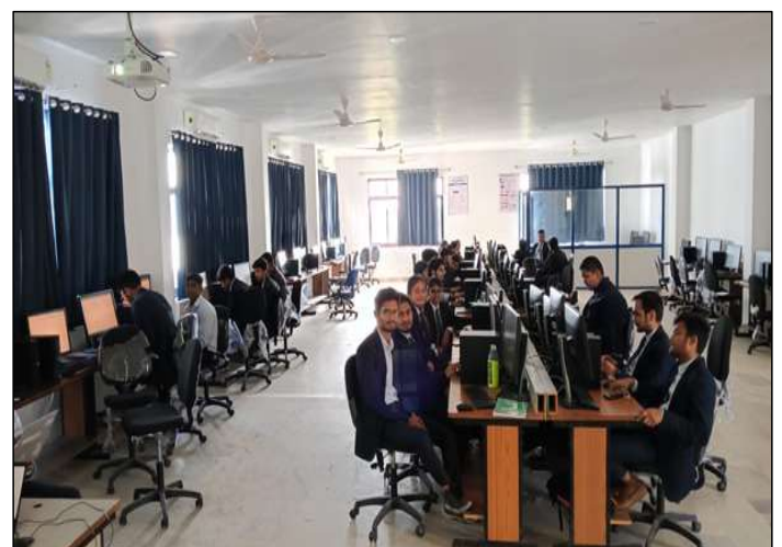
Department of Humanities and Social Sciences organised a training on AI/ML for first year students from 15 th -21 st December, 2023.