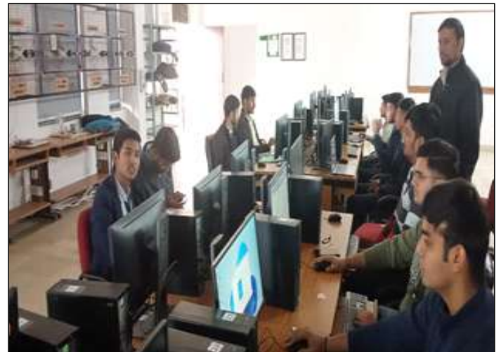
Department of Electrical Engineering organized a training on MATLAB & SIMULINK for third year students from 11 th -13 th December, 2023.