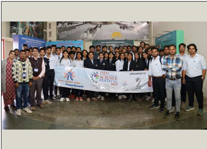
Department of Humanities and Social Sciences organised industrial visit at Institute of Plasma Research (IPR), Ahmedabad on 19 th December, 2023.