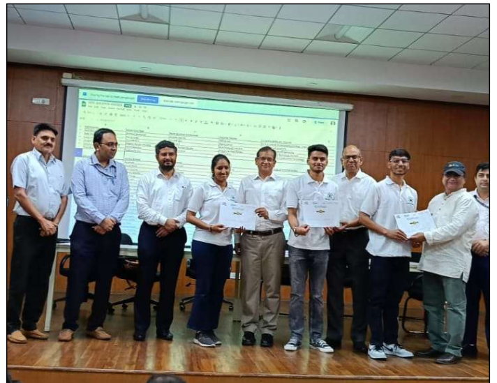
Team ' Debugging Earth ' secured the second position among 145 teams from across India at the MNIT Jaipur 24-Hour Hackathon and won the prize of Rs. 25000/- .