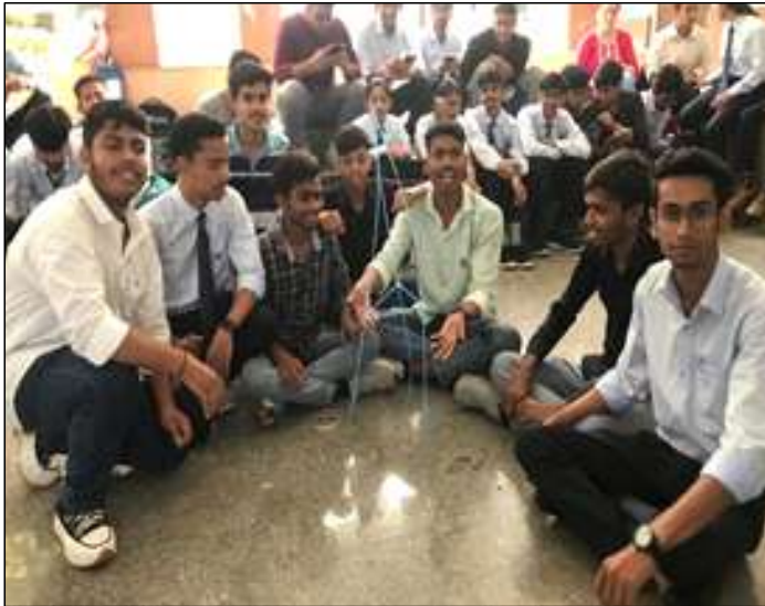
Department of H&S organized Group Activities on “ Coordination, Cooperation & Collective Action ” under the Soft Skill Training Module on 15 th September, 2023.