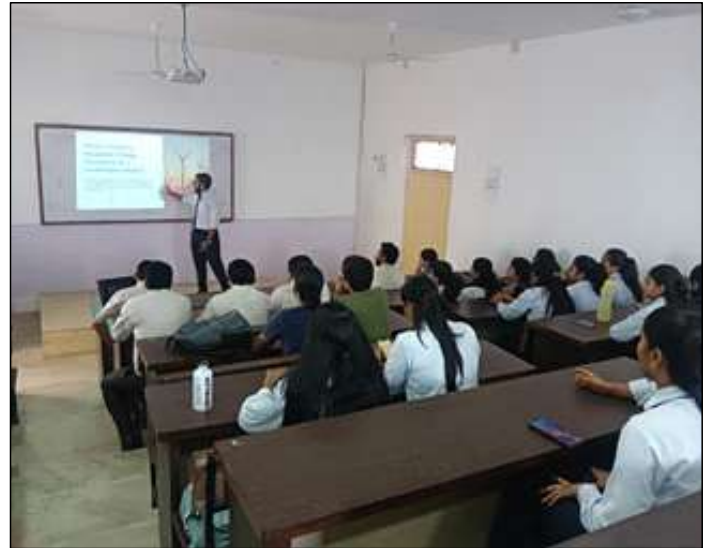
Department of Civil Engineering and Mechanical Engineering jointly organized an Intra College “ Technical Power Point Presentation Contest 2023 ” on 1 st September, 2023.