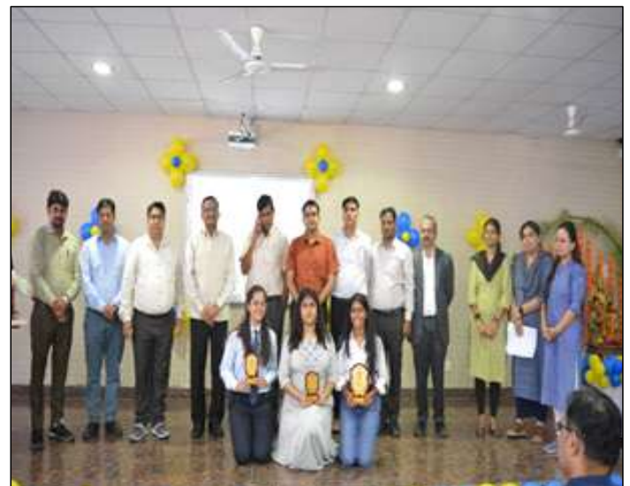
Department of H&S organised the Prize Distribution Function for First Year Induction Program on 13 th September, 2023.