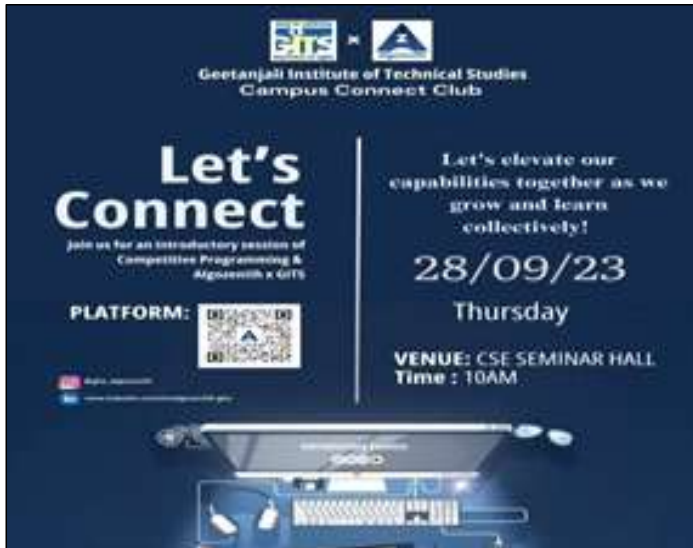
Department of CSE organised a Coding Event “ Competitive Programming ” on 28 th September, 2023 for the students of CSE & AI.