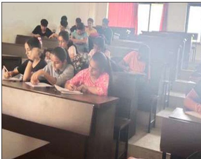
Department of Computer Application organized Essay Writing Competition on 9 th September, 2023.