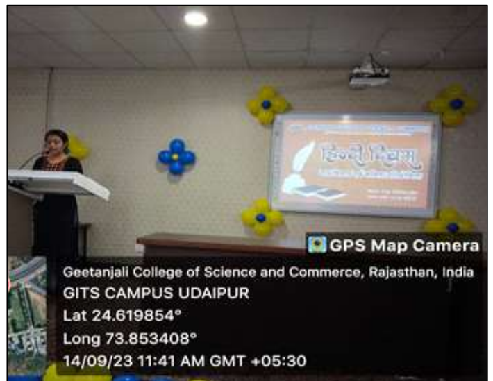
Department of Computer Application organized “ Debate Competition ” on 9 th September, 2023.