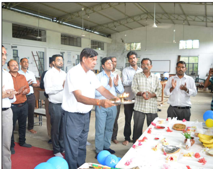
Department of Mechanical Engineering celebrated Vishwakarma Jayanti on 17 th September, 2023.