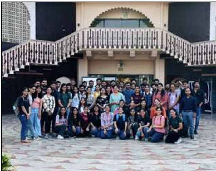
Marketing and Finance Activity organized for MBA 1 st semester students as a part of academic learning on 23 rd September, 2023.