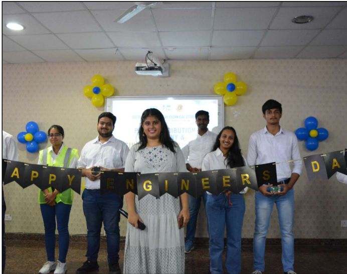
Department of H&S celebrated Engineer's Day on 13 th September, 2023