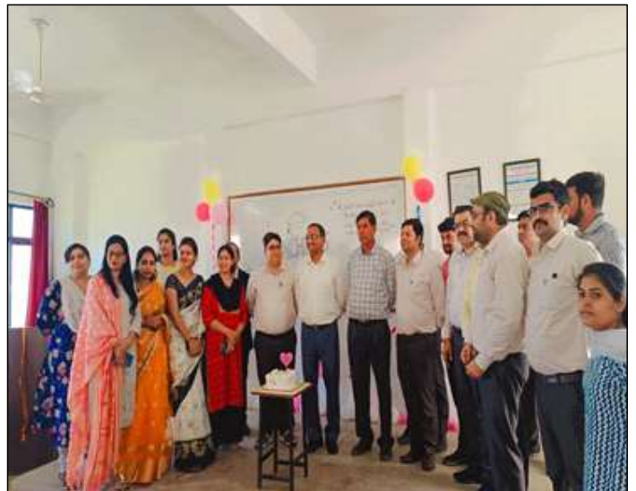
Department of Computer Application celebrated Teacher's Day on 5 th September, 2023.