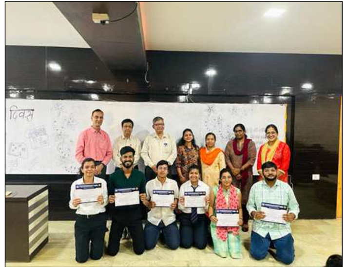
Department of Management Studies celebrated Hindi Divas on 12 th September, 2023