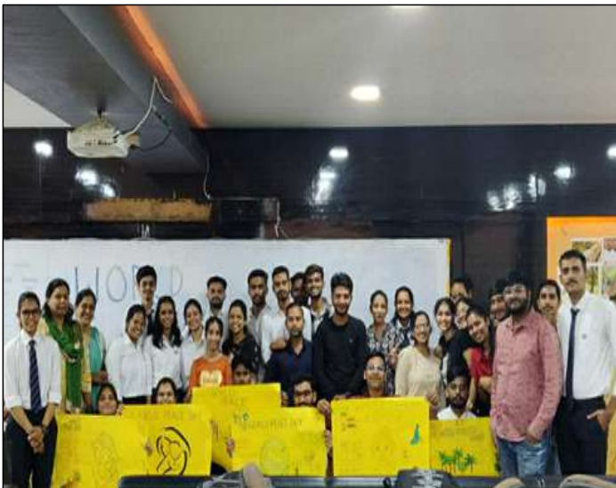
Department of Management Studies celebrated World Peace Day on 21 st September, 2023.