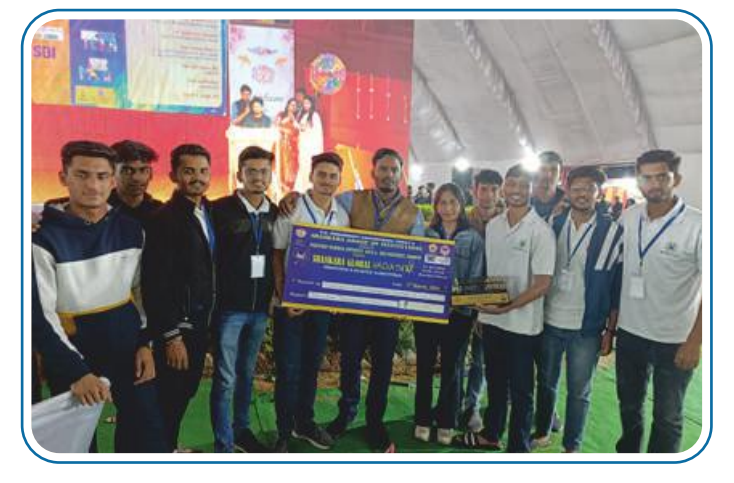
Team "Debugging Earth" won the first runner-up at Shankara Global Hackathon 3.0 , competing against 296 teams from across the country. They won a cash prize of R s 25,000/ -.