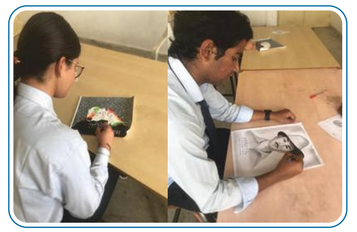
Department of Humanities and Sciences conducted Poster Making Competition on Shaheed Diwas on 23<sup>th</sup> March , 2024.