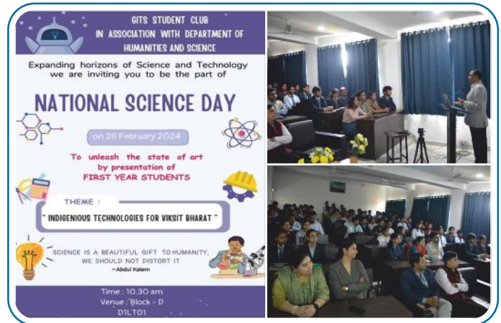
Department of Humanities and Sciences celebrated “National Science Day” on 28 th February, 2024.