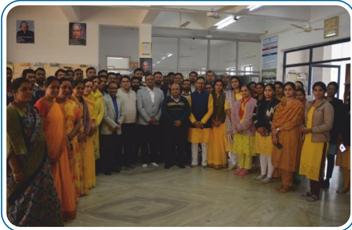
Department of Humanities & Sciences and main Library GITs celebrated “Basant Panchami” on 14 th February, 2024.