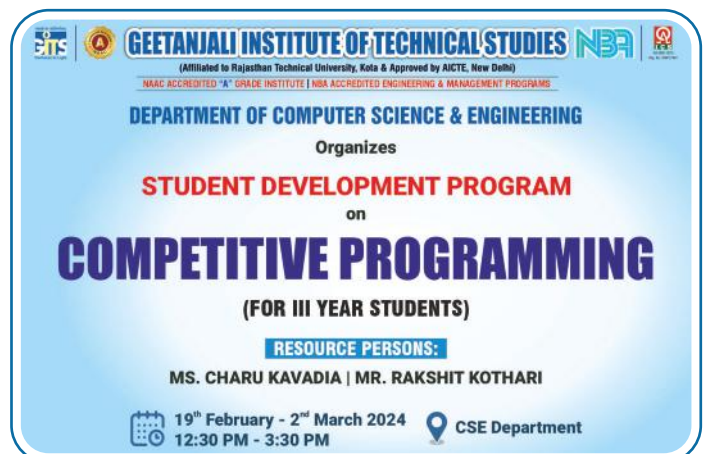
Department of CSE organised Student Development Program on “Competitive Programming” for CSE and CSE-AI, IV Semester from 19 th February to 2 nd March, 2024.