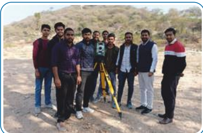
Department of Civil Engineering organised Value-Added Training Program on “Effective Planning & Layout Practices Using Total Station” for final year students during 16 th to 20 th January 2024.