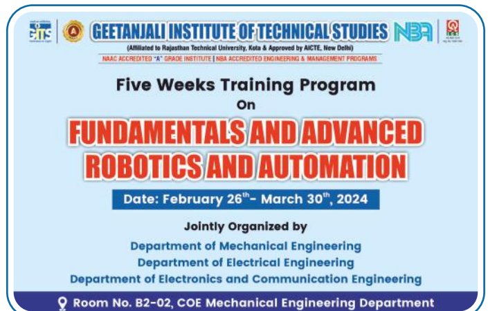
Department of ME, EE and ECE jointly organized Five-week Training Program on “Fundamentals of Advanced Robotics and Automation” starting from 26 th February to 30 th March, 2024.